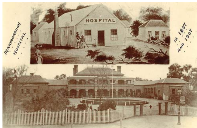
Maryborough Hospital